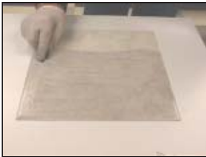
White tile prepared with 30 coats of finish and black dye.

Watch PASS at work ... targeted stripping