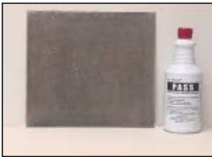
Tile placed in vertical position for 10 minutes.