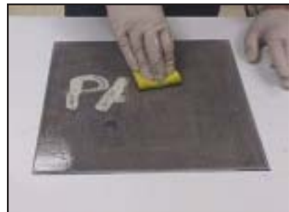
10 minutes later area scrubbed with pad and warm water.