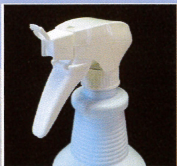
Flip open for either mist or direct spray. Close for foaming spray.