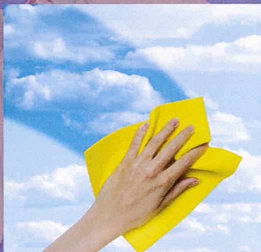
Formulated for STREAK-FREE Glass Cleaning