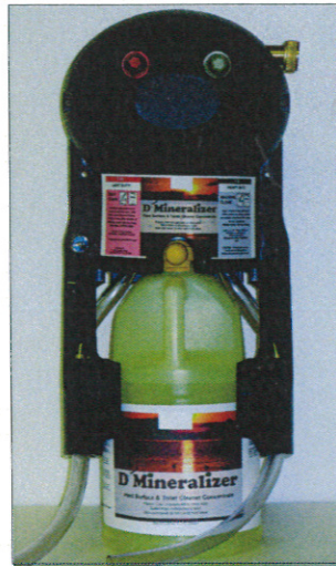
Fits standard mineral cleaner dilution control systems